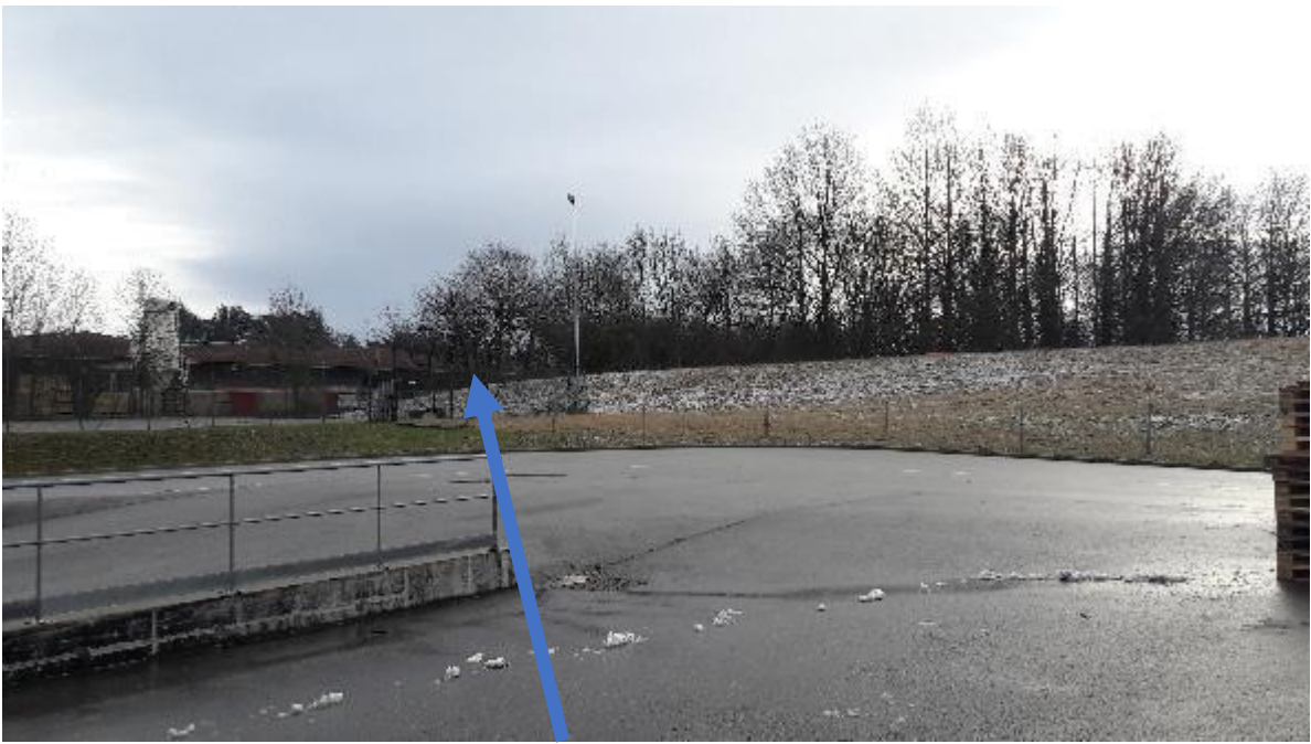
Angle de prise de vue