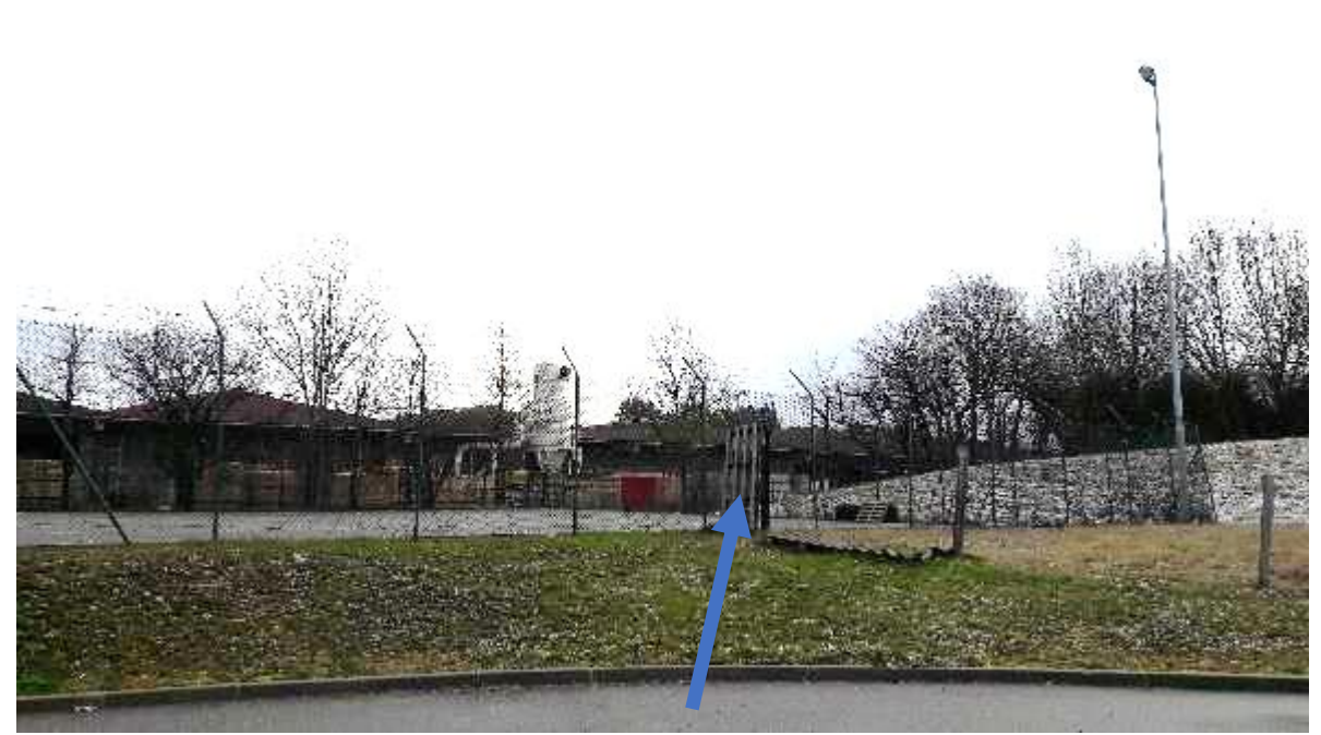
Angle de prise de vue