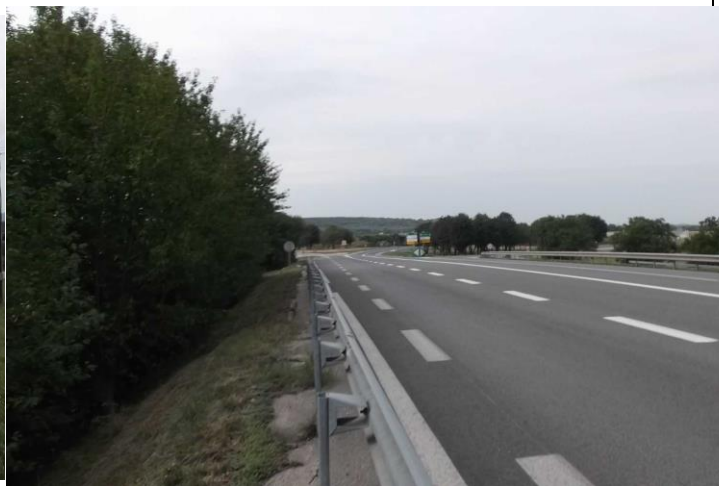
Photo 2 - RD1075