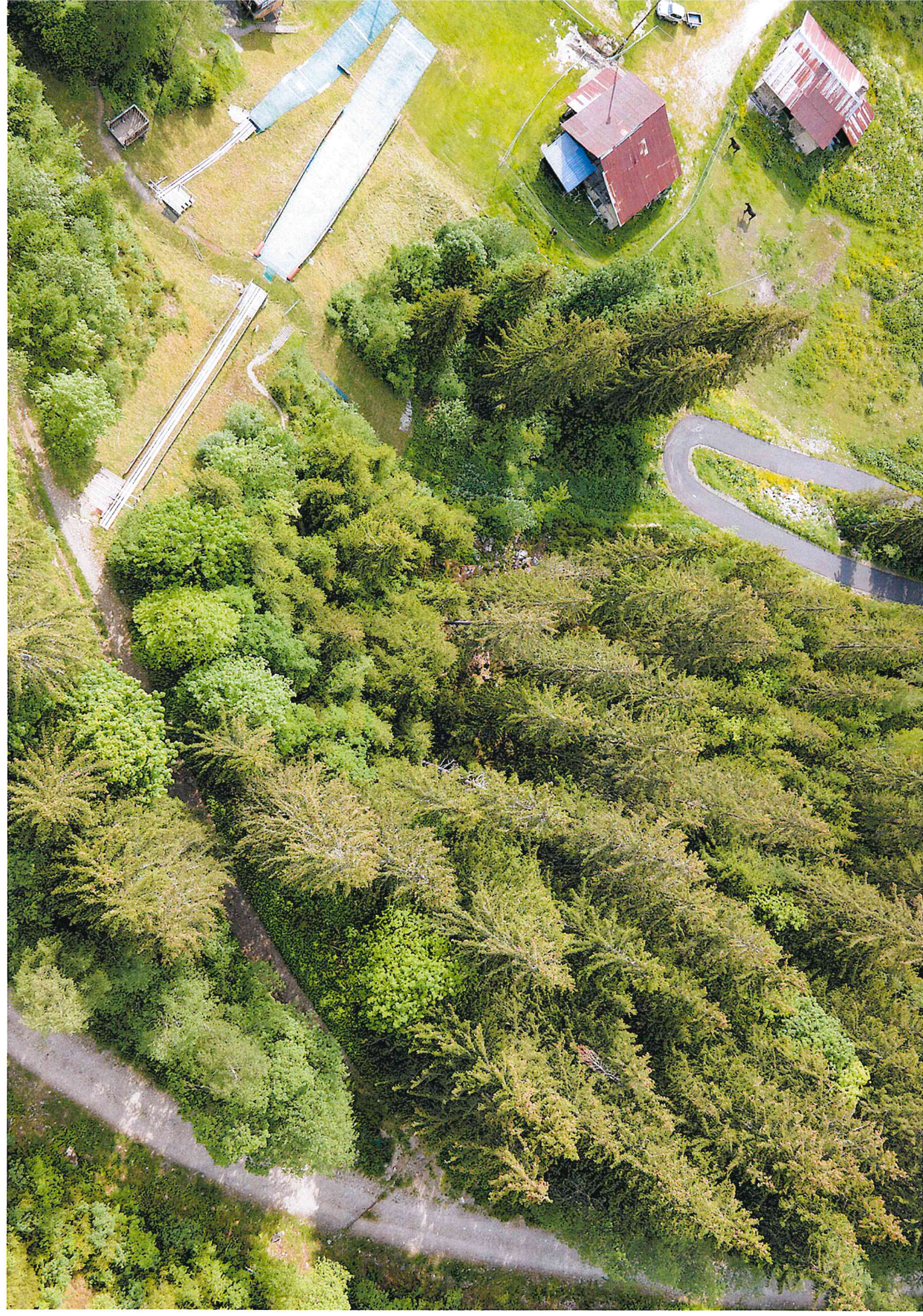
Figure 1: Aerial view of the study area showing the forest and the road.