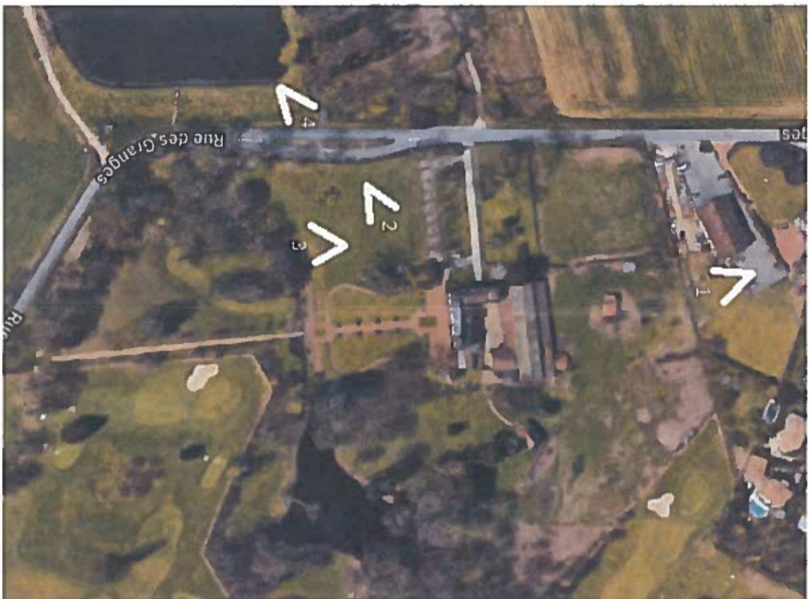
Les points de vue